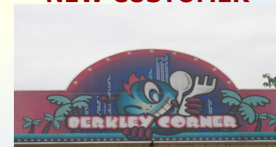
Restaurant Berkley Corner Jalan Angsa Kawasan 17, Taman Berkley Klang 41200 Selangor