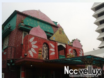
Passage Thru India Restaurant No.235, Jalan Tun Razak 55100 Kuala Lumpur