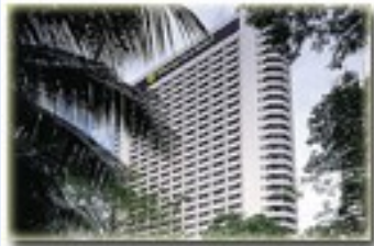
Shangri-La Hotel Kuala Lumpur No11, Jalan Sultan Ismail 50250 Kuala Lumpur